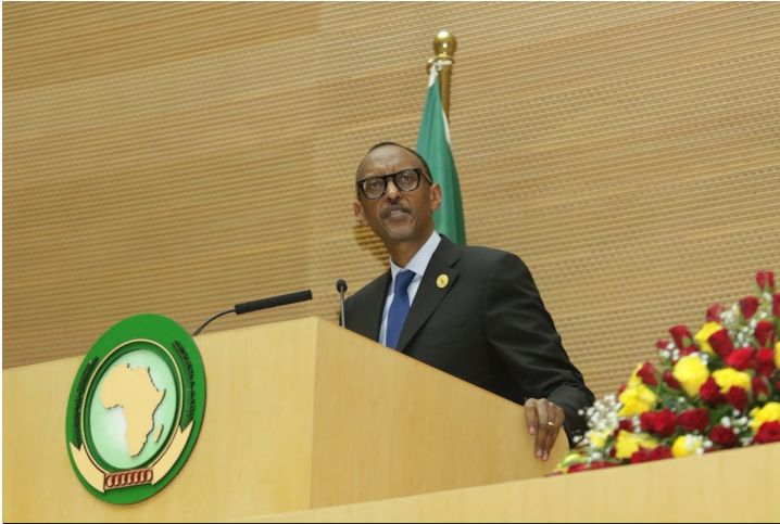
The President of Rwanda and African Union Chairperson, H.E Paul Kagame

In his statement, the President of Rwanda, H.E Paul Kagame thanked NEPAD for being forward looking in positioning itself within the African Union even before the current reform was on the agenda.