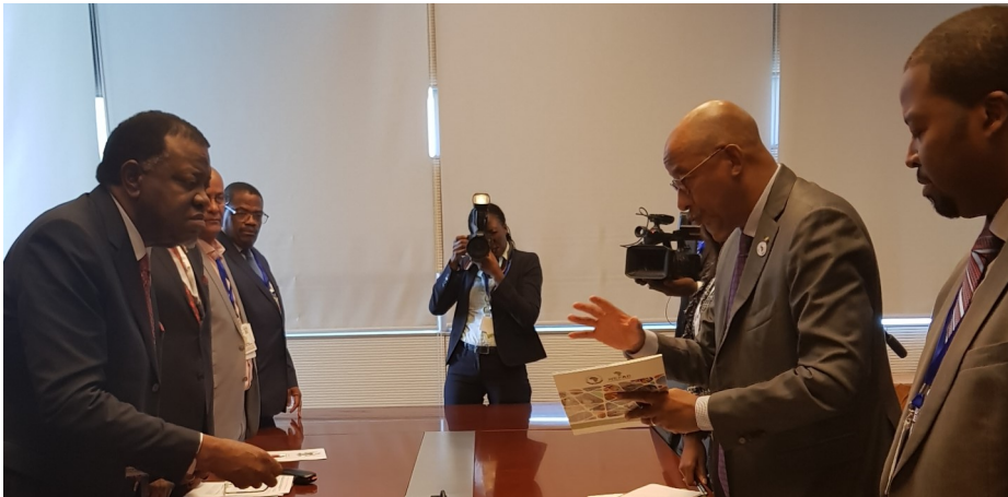
Meeting between the NEPAD Agency and the President of Namibia, H.E Dr Hage Geingob

Below are some of the pictures taken during the above-mentioned events and meetings: