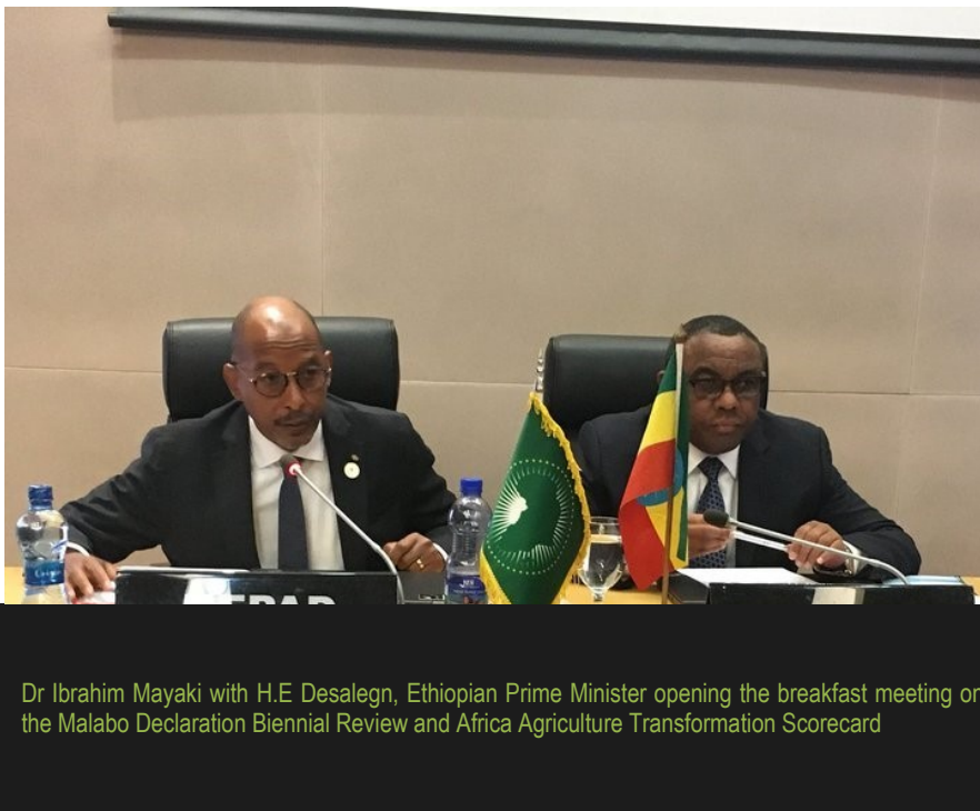
Dr Ibrahim Mayaki with H.E Desalegn, Ethiopian Prime Minister opening the breakfast meeting on the Malabo Declaration Biennial Review and Africa Agriculture Transformation Scorecard