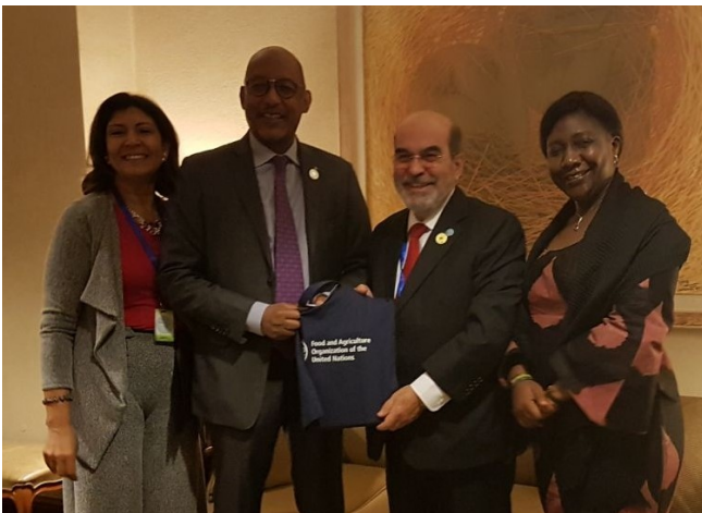
Meeting between the NEPAD Agency and FAO